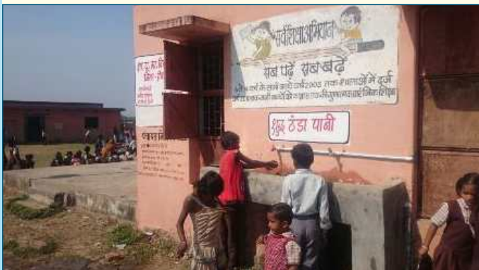
Safe Drinking water facility installed for Primary School