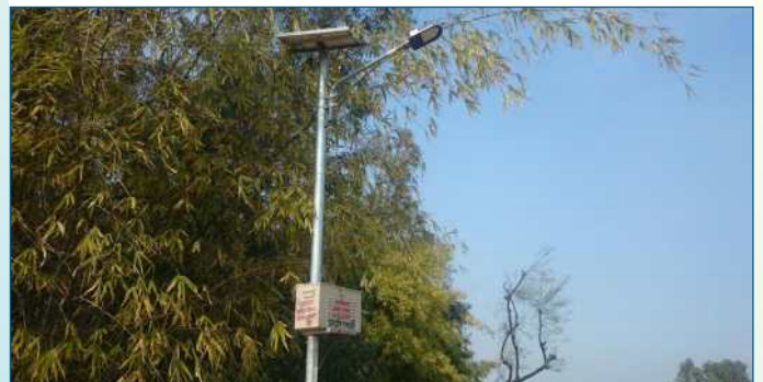
Solar Power Operated Lighting

This power will be used in case of shortage of electricity and will be covered under green methods of generating electricity. The power cells will be charged during day time with the help of solar energy and generate electricity during night. This CSR project will enable these health centres to work during night time and provide better health services to the village folks.