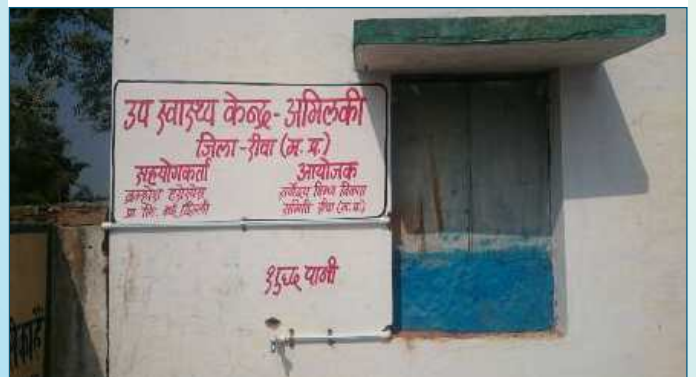
Health Centre in Amiliki Village