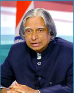
Dr. A P J Abdul Kalam Former President of India

“Corporate Social Responsibility (CSR) activities should be sustainable and help in building capacity. CSR if it is implemented with sustainability as a focus, then it enhances business sustainability, provides new opportunities, develops customer loyalty and improves stakeholder relationship”.