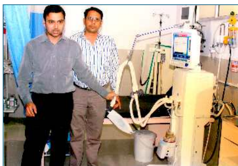
Neonatal ICU Ventilator