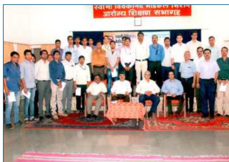
Vivekanand Medical Mission